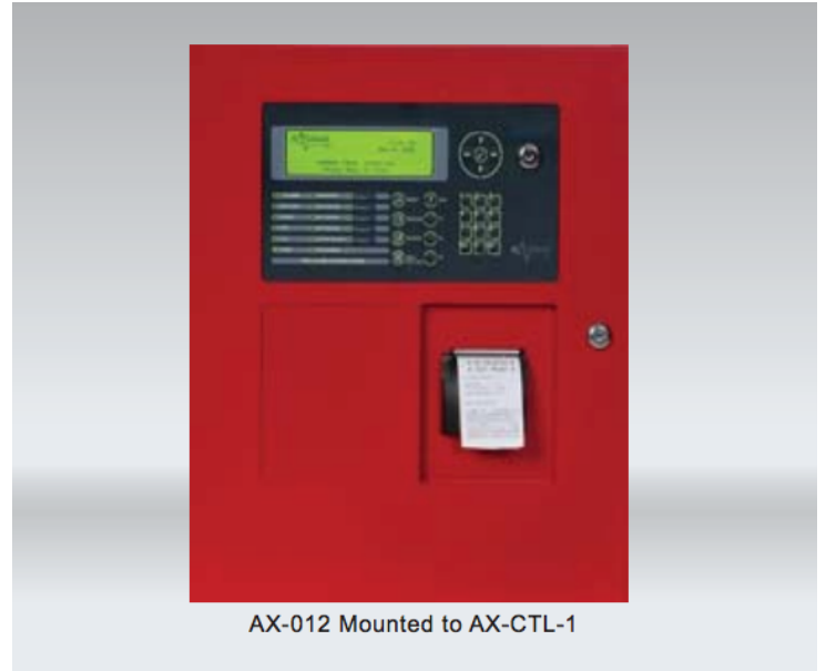
AX-012 Mounted to AX-CTL-1

Spare rolls of thermal paper can easily be replaced due to the mechanisms easy access front-loading compartment.