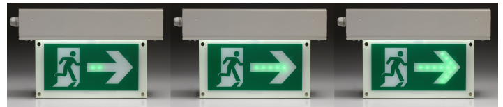
Active pulsing green arrow mode

The dynamic pulsing green arrow can be triggered either manually (e.g. a key switch) or automatically by integrating our LuxIntelligent automatic testing panel with any existing fire alarm system via simple input/output modules. The dynamic pulsing green arrows can be triggered either as individual devices, in zones or all at once, providing proof of compliance to BS 5266-1 and improving the life safety and evacuation speed of occupants.