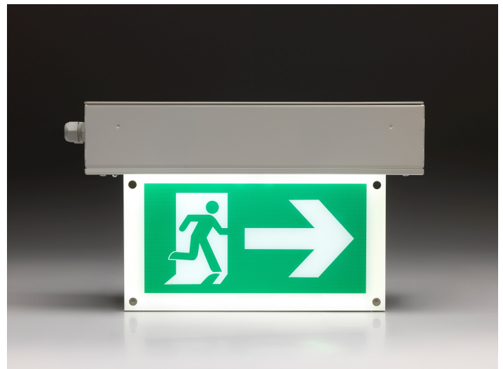
Compliant static / passive mode