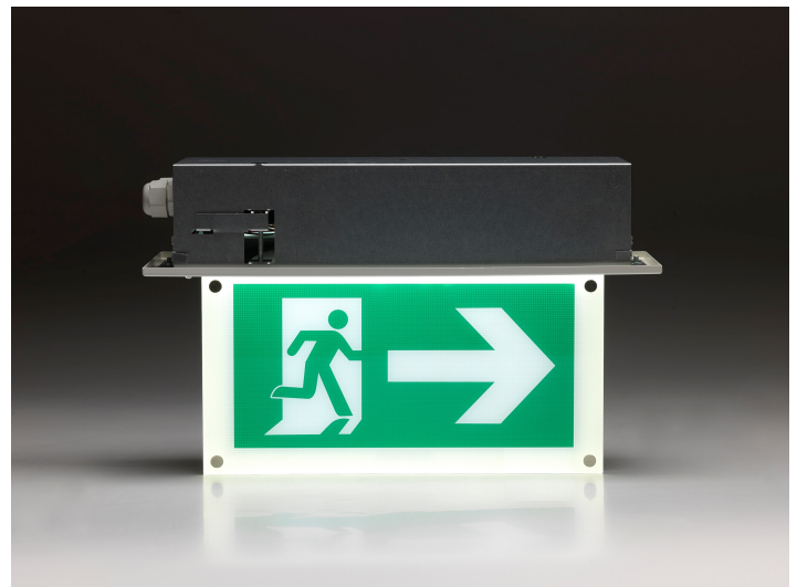
Compliant static / passive mode