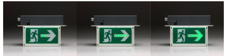
Active pulsing green arrow mode

The dynamic pulsing green arrow can be triggered either manually (e.g. a key switch) or automatically by integrating our LuxIntelligent automatic testing panel with the existing fire alarm system via simple input/output modules. The green arrows can be triggered either as individual devices, in zones or all at once, providing proof of compliance to BS 5266-1 and improving the life safety and evacuation speed of occupants.