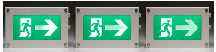
Active pulsing green arrow mode

The dynamic pulsing green arrow can be triggered either manually (e.g. a key switch) or automatically by integrating our LuxIntelligent automatic testing panel with any existing fire alarm system via simple input/output modules. The dynamic pulsing green arrows can be triggered either as individual devices, in zones or all at once, providing proof of compliance to BS 5266-1 and improving the life safety and evacuation speed of occupants.