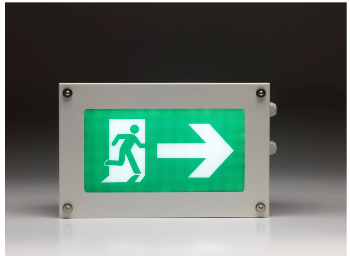
Compliant static / passive mode