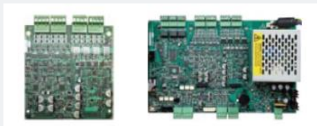
AX-LPD 2 SLC & 2 NAC Expansion - AX-CTL-2PCB Base Card