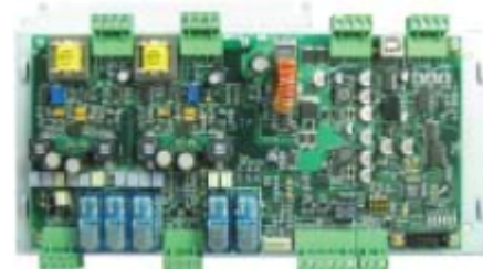
AV-AMP-80 Audio Amplifier

AV-MIC: Microphone with enclosure. Mounts to all modular command centre inner doors, in a single aperture location.