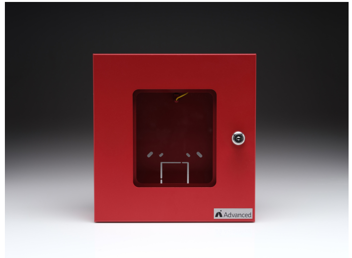
AX-LZA-CAB1 Single Aperture, Local Zone Annunciator Enclosure

The AX-LZA-CAB1, AX-LZA-CAB2 and AX-LZA-CAB4 enclosures are designed to be surface or semi-flush mounted with optional trimming (AX-LZA-CAB1-TR, AX-LZA-CAB2-TR or AX-LZA-CAB4-TR). The enclosures can also be mounted to a 4" double gang electrical box.